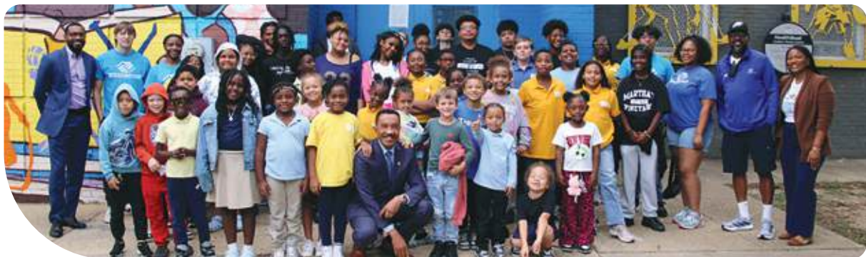
Rep. Mfume visits with young people at the Boys & Girls Club in South Baltimore.