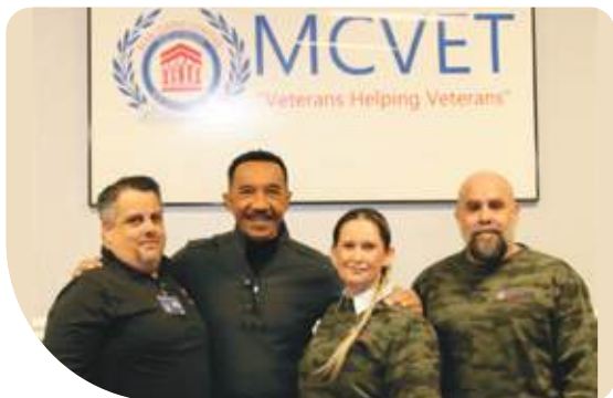
Rep. Mfume met with veterans at the Maryland Center for Veterans Education and Training on a day of service.