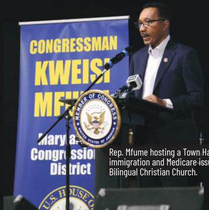
Rep. Mfume hosting a Town Hall to discuss immigration and Medicare issues at the Bilingual Christian Church.