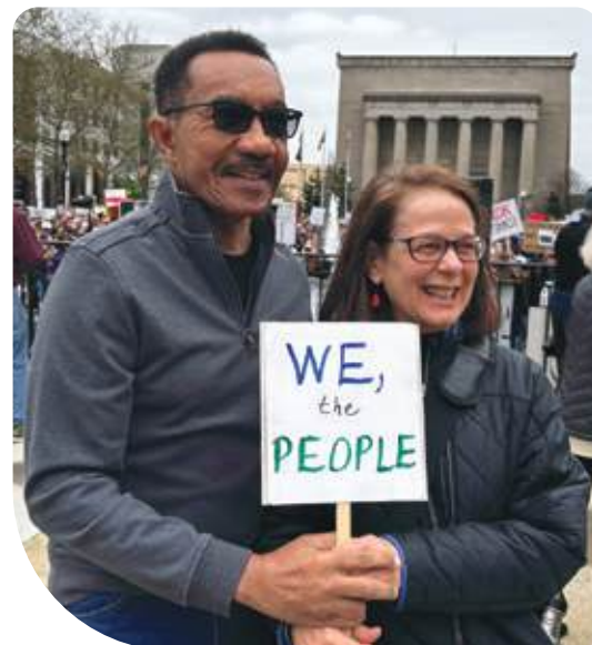
Rep. Mfume meeting with constituents at the nationwide "Hands Off" event.