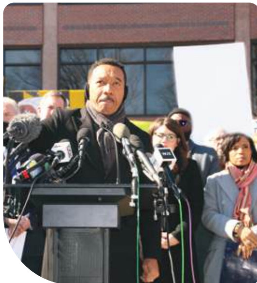
Rep. Mfume advocating to protect federal workers and government services from cuts at the U.S. Social Security Administration.