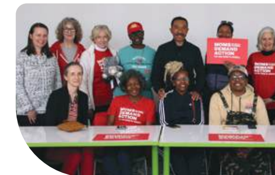
Rep. Mfume meeting with advocates from the gun safety group Moms Demand Action.