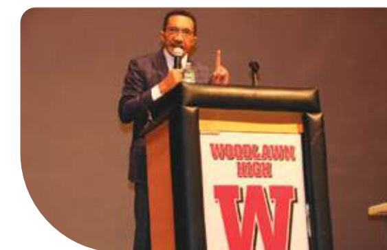
Rep. Mfume speaking out against Trump policy cuts at Woodlawn Town Hall.