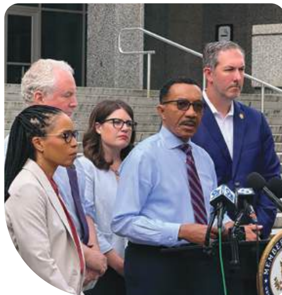
Rep. Mfume conducted a visit at the Baltimore ICE Holding Facility.