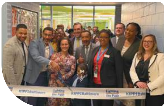
Rep. Mfume attends the ribbon cutting for a new library at the KIPP Academy in Walbrook Junction.