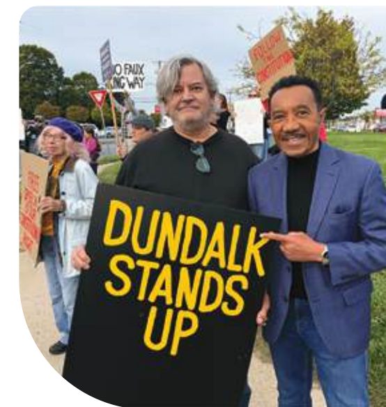
Rep. Mfume spoke with constituents in Dundalk at a "No Kings" event.