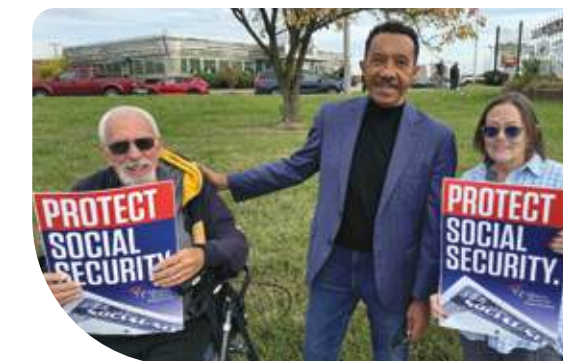
Rep. Mfume fighting on behalf of Social Security recipients.